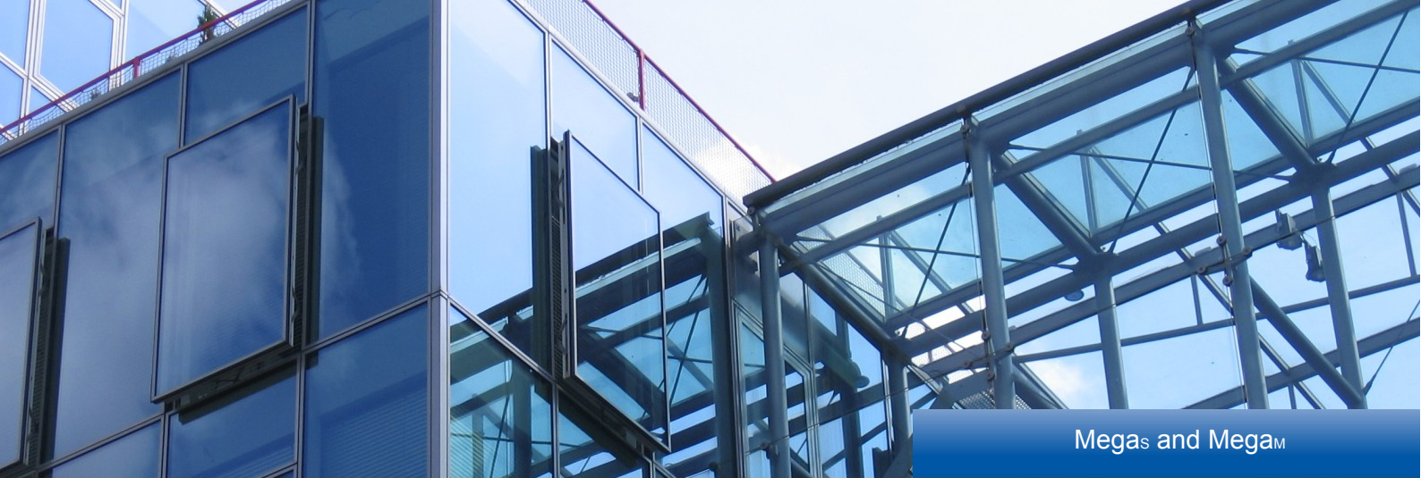
Mega S and Mega M