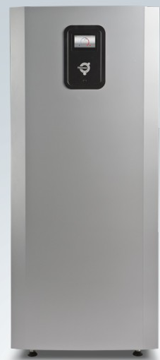
Mega L and Mega XL

A+++ energy class when the heat pump is part of an integrated system A+++ energy class when the heat pump is the sole heat generator Energy class according to Eco-design Directive 811/2013